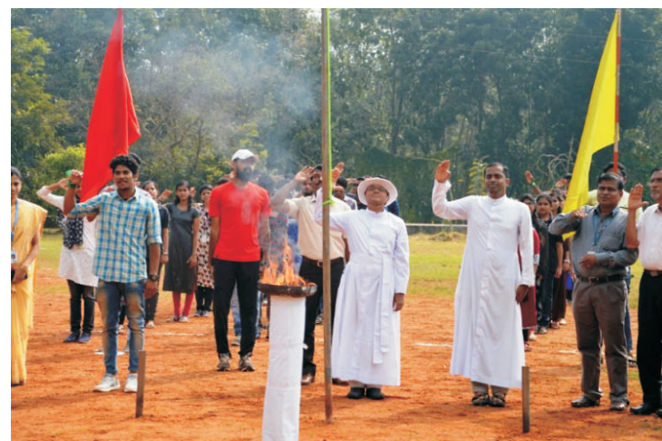
Sports Day 2018