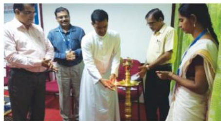
Inauguration of total station survey training

* The Department of Civil Engineering jointly